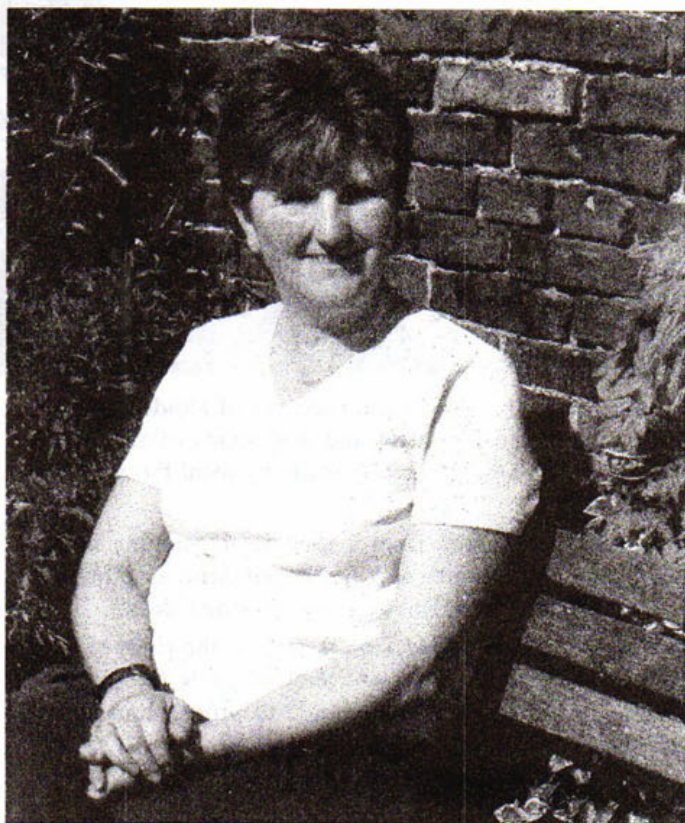
Nice to be home! Tunstall 19th May

On 10th May she attended the Parish Council meeting in the Memorial Institute. No camel spiders there!